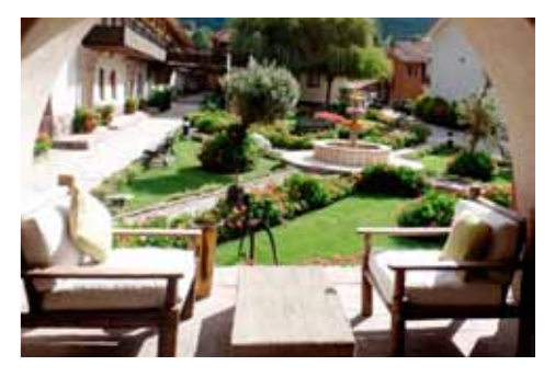
EL MAPI: MACHU PICCHU PUEBLO, PERU