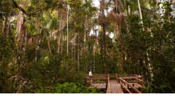
APR 2 Cusco - Amazonia

You will be picked up at your hotel lobby in accordance with your onward flight to Puerto Maldonado. Upon arrival you will be met by an Inkaterra Reserva Amazonica representative and be taken to the pier and head upriver for approximately an hour to the lodge. Before boarding the boat, you will have the opportunity to reshuffle some of your baggage to bring a smaller amount of your luggage to the lodge (remaining luggage will be locked up and remain in their offices until you return from the lodge).