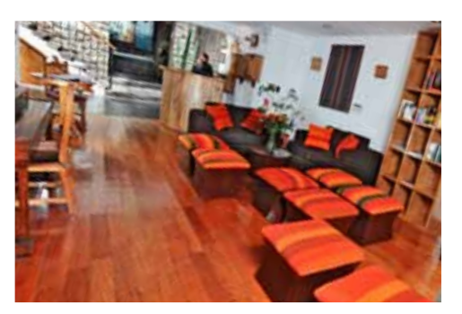
RESERVA AMAZONICA: AMAZON BASIN, PERU